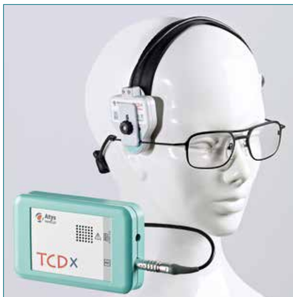
Probe fixation and recording system with an inbuilt loudspeaker